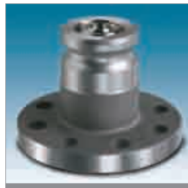
1673ANF and 1673ANFT